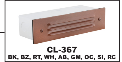
CL-367 BK, BZ, RT, WH, AB, GM, OC, SI, RC