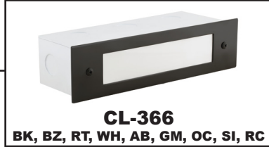
CL-366 BK, BZ, RT, WH, AB, GM, OC, SI, RC

Please read carefully before installation SAVE THESE INSTRUCTIONS