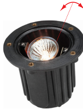
Fixture socket tilts for ± 25°