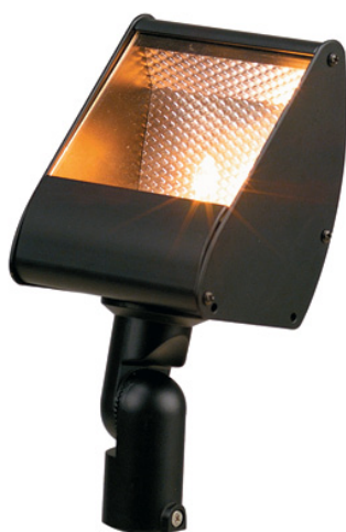
BK-Black finish shown

Warranty: One (1) year warranty on fixture housing against manufacturer's defects.